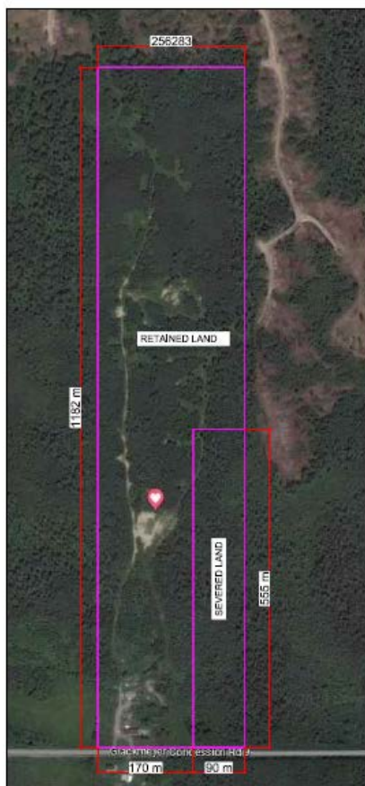
OVERALL • NTS