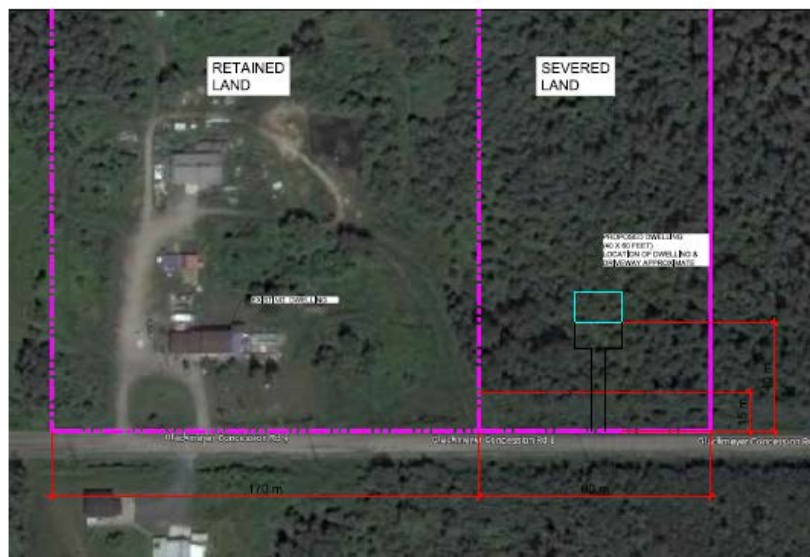
ENLARGEMENT • NTS